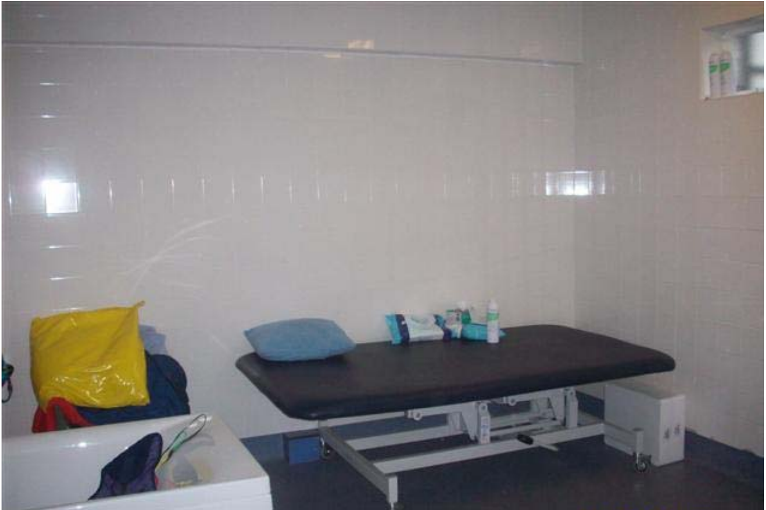
Room 1 – larger sized changing couch