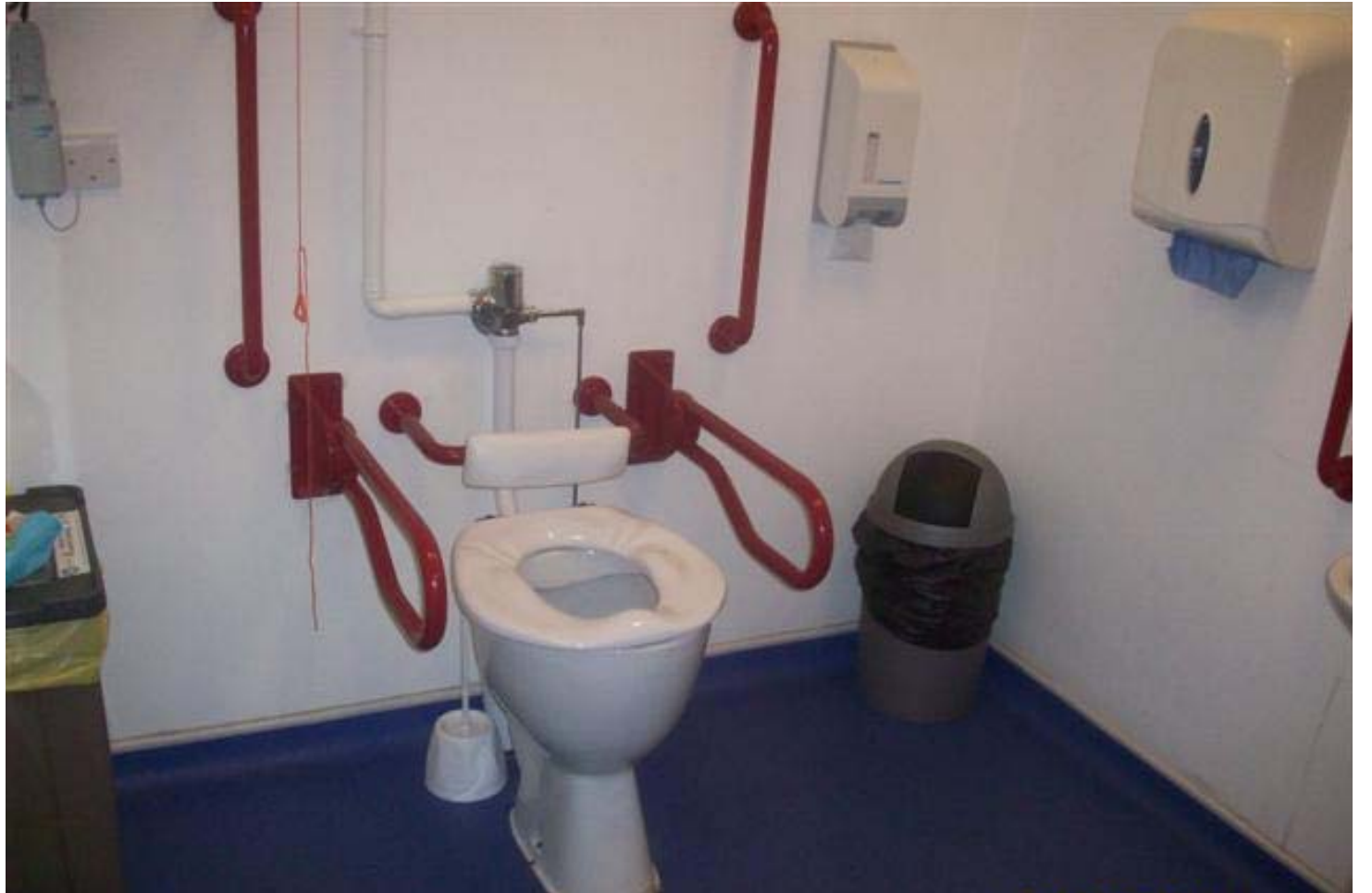
Separate accessible toilet