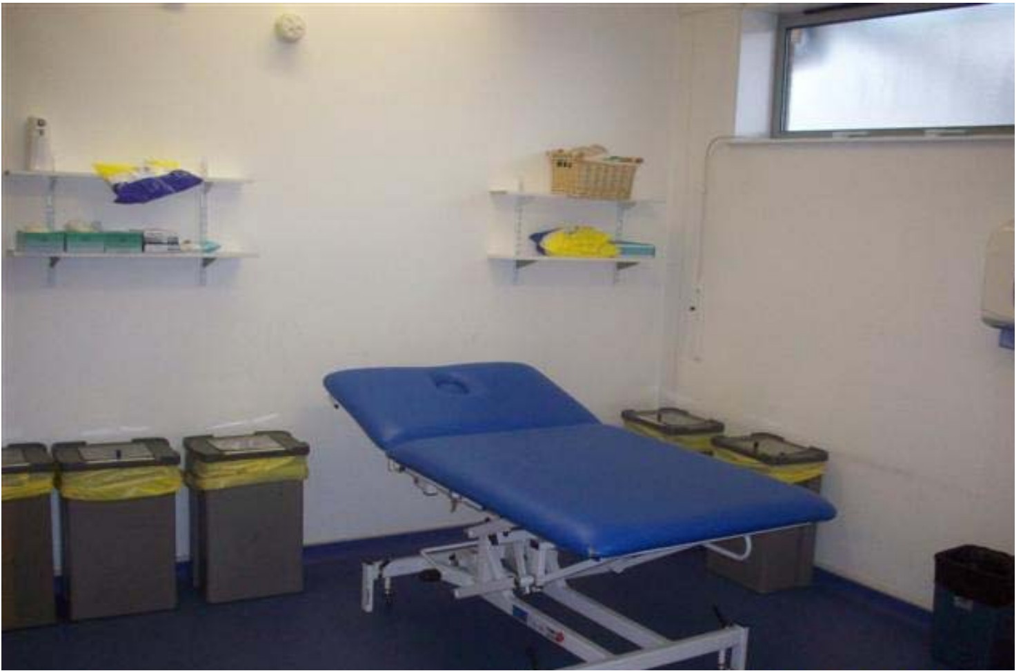
Room 2 layout