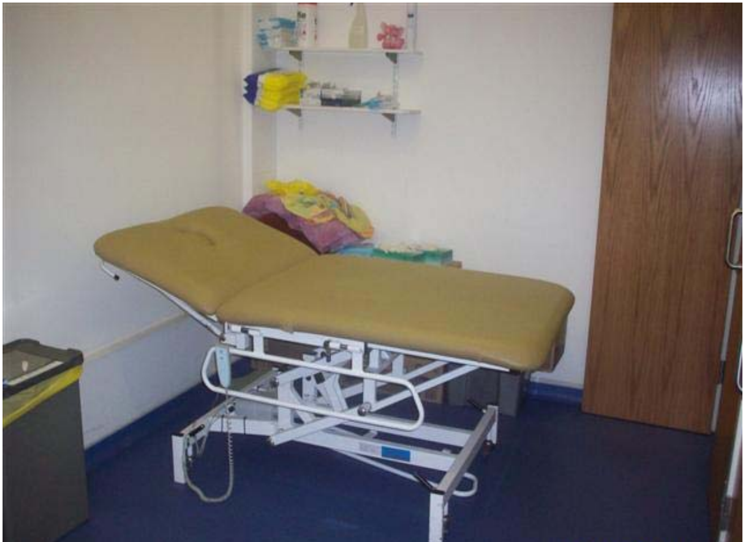
Room 1 layout