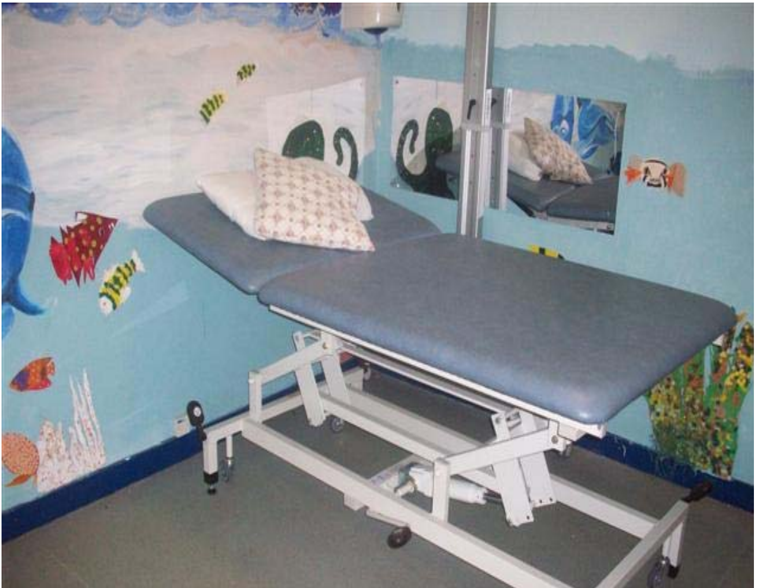
Free standing, height adjustable changing couch