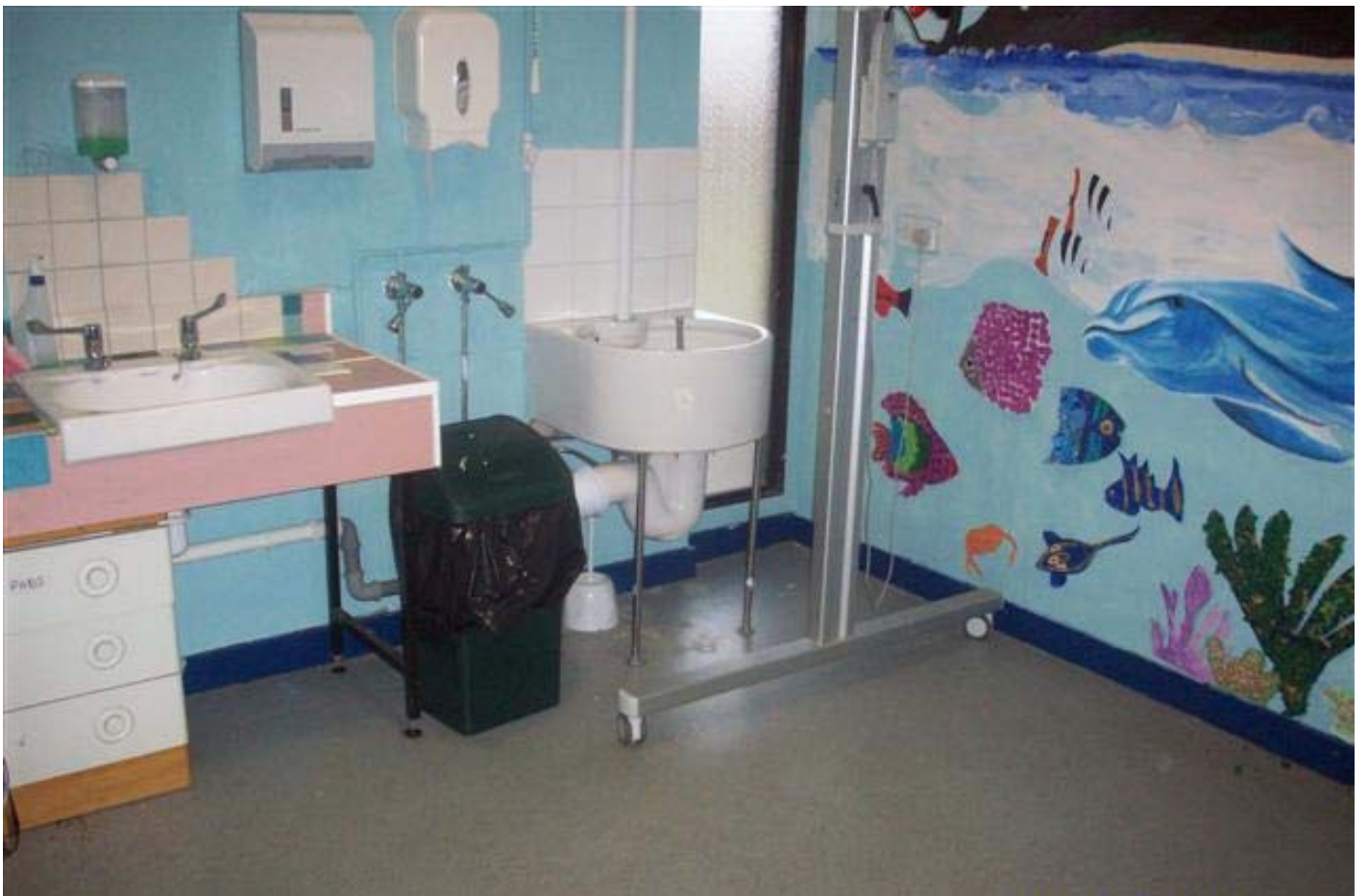
Plenty of space for manoeuvrability