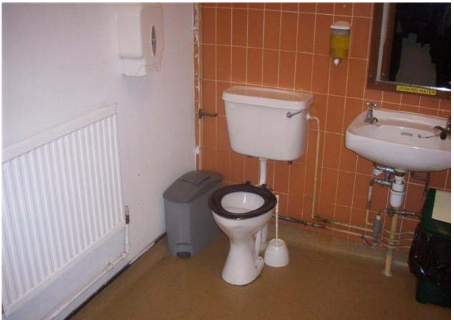
Accessible toilet located next door to changing room